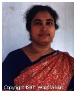
Copyright 1997 World Mission Source: Bethany World Prayer Center

Population: 161,000 World Popl: 170,300 Total Countries: 2 People Cluster: South Asia Tribal - other Main Language: Hindi Main Religion: Hinduism Status: ● Unreached Evangelicals: Unknown % Chr Adherents: 0.15% Scripture: Complete Bible