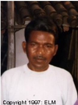
Copyright 1997: ELM Source: Bethany World Prayer Center

Population: 451,000 World Popl: 455,200 Total Countries: 2 People Cluster: South Asia Hindu - other Main Language: Telugu Main Religion: Hinduism Status: 🔴 Unreached Evangelicals: Unknown % Chr Adherents: 1.08% Scripture: Complete Bible