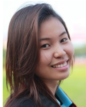
Source: à,%à,Şà,µà,Şà,£à,£à," à¹Eà,zà,"à

Population: 7,758,000 World Popl: 7,798,000 Total Countries: 2 People Cluster: Thai Main Language: Thai, Northern Main Religion: Buddhism Status: ● Unreached Evangelicals: 0.03% Chr Adherents: 0.20% Scripture: New Testament